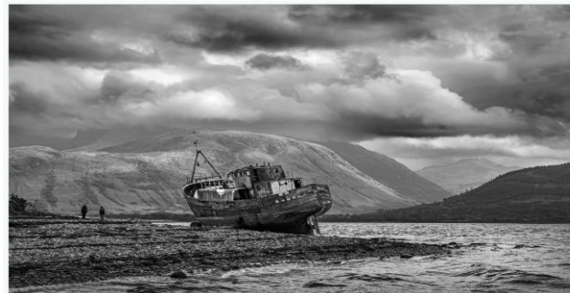
Shipwreck at Corpach

Wessex Colour Group Last Tuesday of Month in October Judge TBA