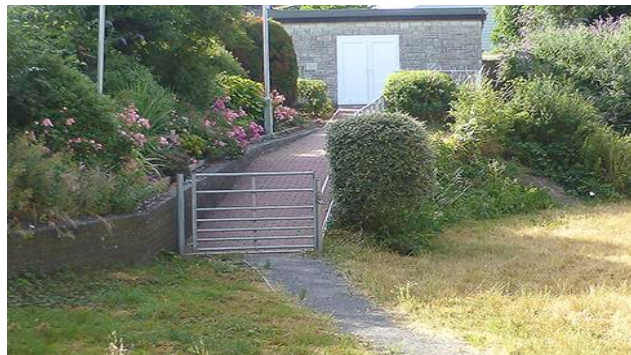
Blandford Forum Camera Club