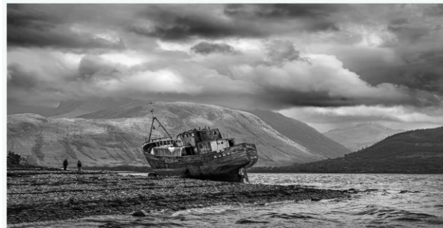
Shipwreck at Corpach

Wessex Colour Group Last Tuesday of Month in October Judge TBA